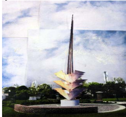
(artists rendering of sculpture to be at Salem and Catalpa)